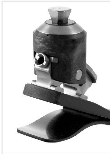
Runway HX adjustment location